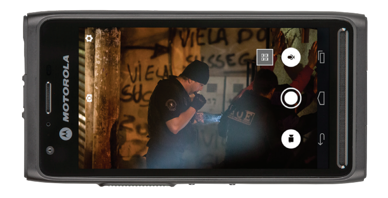
Request a demo by contacting your local sales representative or online at www.motorolasolutions.com/capture

Is Your Team Ready To Make The Case? Cases can evolve in a matter of minutes. Your team's success at catching criminals is dependent on being able to secure the proof that puts them behind bars, no matter where it is. So why put up with the delay of getting crime scene detectives on site when time is of the essence? Instead, expand your ability to capture law-enforcement-grade digital evidence with the simplicity of a smartphone, with the Capture App.